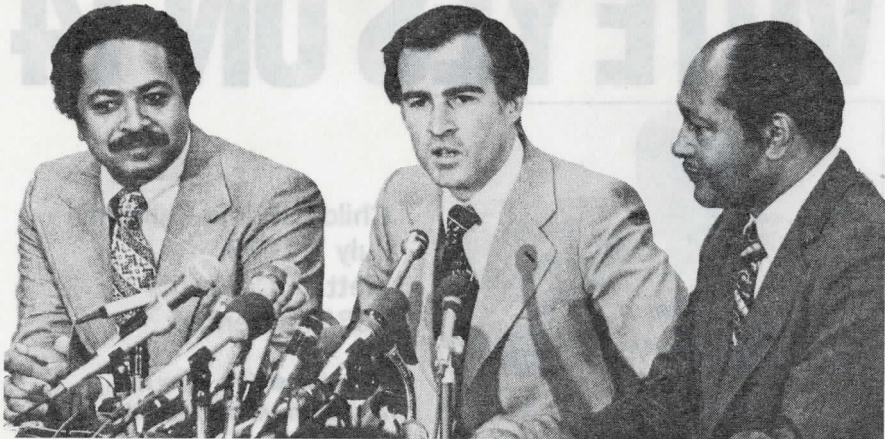
Lt-Governor Mervyn Dymally